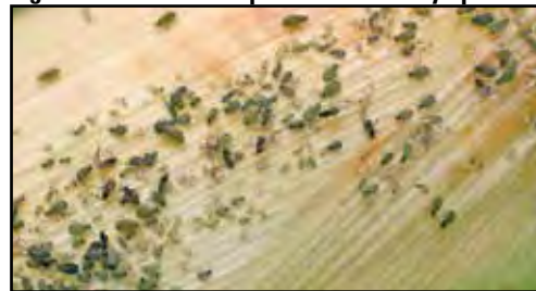
Figure 8.21. Corn leaf aphid adults and nymphs