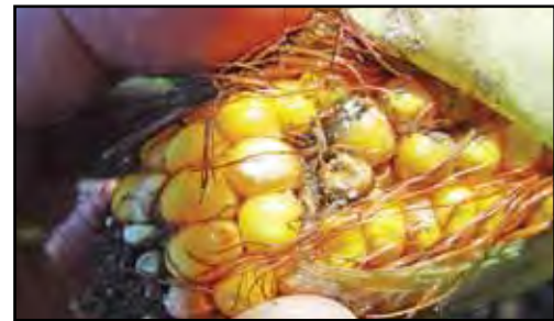
Figure 8.17. Sap beetle larvae on a corn ear