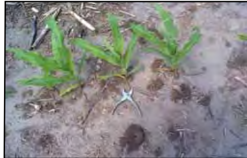
Figure 8.20. Suspected area (due to numerous ant nests present and corn injury symptoms) of corn root aphid infestation