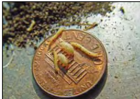
Figure 8.2. Larvae and pupae of corn rootworms