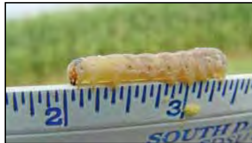
Figure 8.10. Western bean cutworm larva