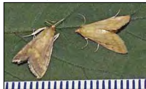
Figure 8.7. European corn borer moths