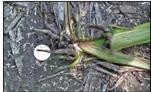
Figure 8.4. Root pruning caused by rootworm larvae on corn