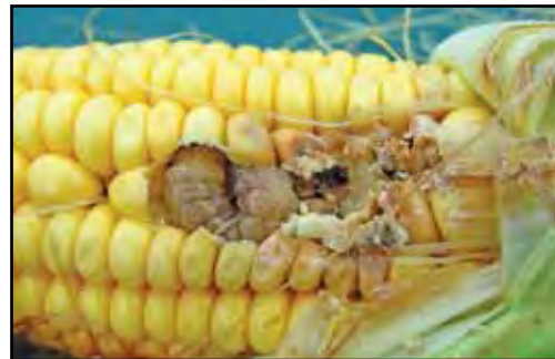
Figure 8.11. Western bean cutworm injury