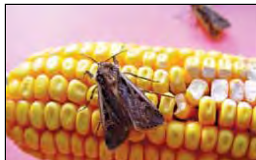
Figure 8.12. Western bean cutworm moth