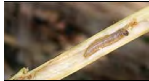
Figure 8.6. European corn borer larva