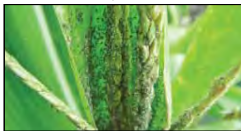
Figure 8.22. Corn leaf aphids on tassel and leaf