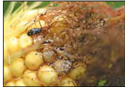
Figure 8.15. A picnic (sap) beetle on a corn ear