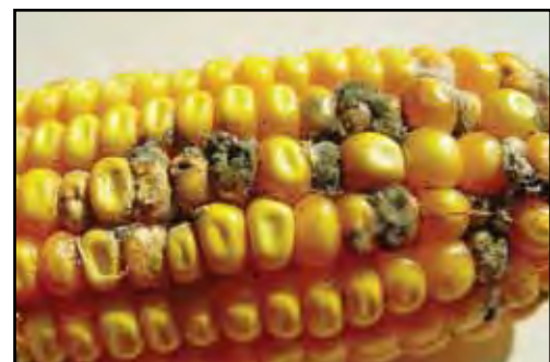
Figure 8.18. Fungal infection on a corn ear after sap beetle injury