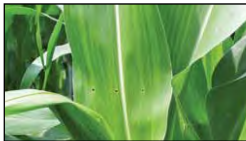
Figure 8.9. Shot-hole symptoms of corn borer infestations