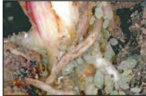
Figure 8.19. Corn root aphid adults and nymphs

Bluish-green wingless and winged corn leaf aphids range in size from 1/16 to 1/8 inch (fig. 8.21); both wingless and winged forms may be present. Corn leaf aphids can usually be found in the whorl, tassel, developing ears, and upper leaves. Heavily infested plants may appear “messy” or “sticky” (fig. 8.22).