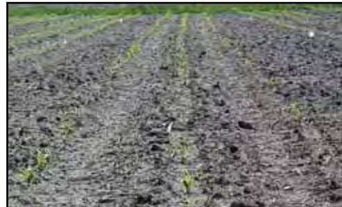
Figure 8.14. Missing corn seedlings due to black cutworm injury