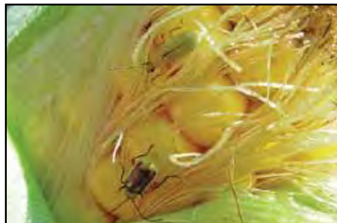
Figure 8.1. Adult beetles of northern corn rootworm (top) and western corn rootworm (bottom)