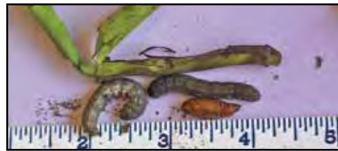
Figure 8.13. Black cutworm larvae, pupa, and cut seedling