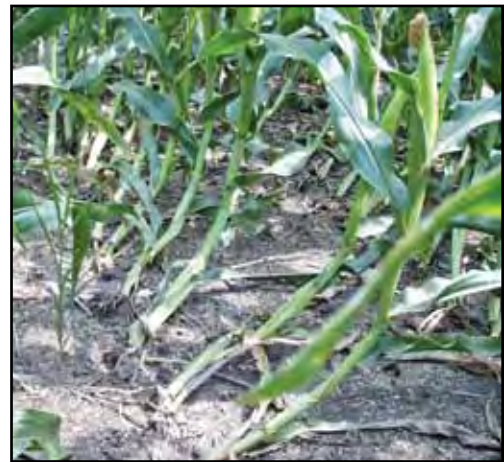
Figure 8.5. Lodging, or “goosenecking,” of corn plants as a result of rootworm injuries