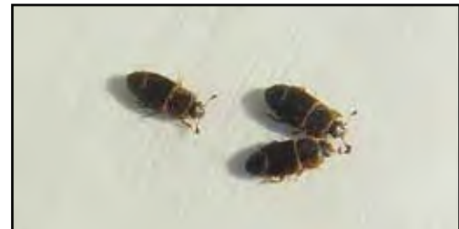
Figure 8.16. Dusky sap beetles